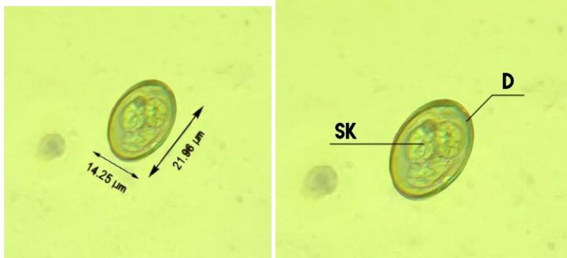
Figure 1. Eimeria sp. on microscopic examination with 400x magnification in fruit bat feces samples. Note: SK (Sporocyst) and D (Oocyst wall).